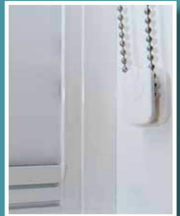
Chain tension device