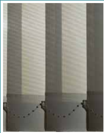
Welded bottom pockets